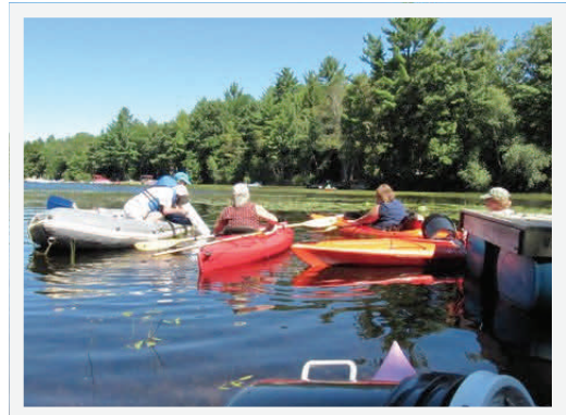
Participants of a YCIASP collaborative aquatic plant survey on Mousam Lake, 2012